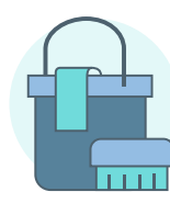
Mop or cloth and soapy water